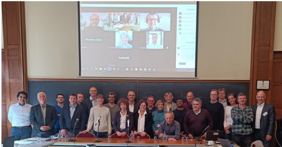
Fig. 3 ArtEmis collaboration at General Assembly organised by JRC in Brussels, 20 th -22 th March 2024.