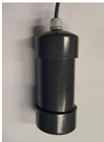
Fig.1 ArtEmis sensor unit in a watertight housing. Figure by J. Gerl.

ArtEmis prototype sensor units were designed and produced at GSI, Darmstadt (see Fig.1 below).